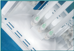
Multi-Faceted Reflector (Designed for Maximum Efficiency)