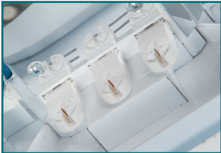
Vossloh Locking Lampholders (Standard)