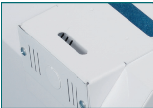
Special Mounting Details (Allows for Mounting to Unistrut)