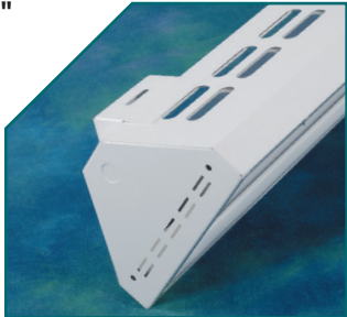
Uplight Details Shown (Optional)