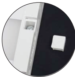
Pre-positioned installation screws