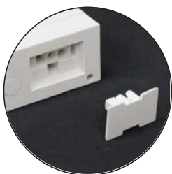
Link several under cabinets together with the Linkable Connector Wire