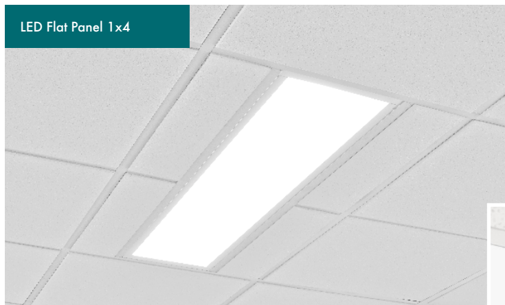
Optional Wireless Sensor Shown Installed